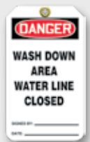
Standard Bilingual Lockout Back

Create your Custom Tag starting on page 368.